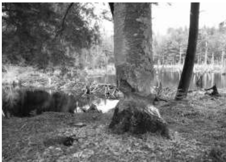
Beaver pond, October Mountain State Forest.

Gates open at 4:00 PM. Dinner served at 7:00 PM. Cost is $8. Bring a dish to share for 4; cold drinks and chicken will be provided. Or come just for the fireworks display. Fireworks will be viewed at dark, launched from Stanley Park, Westfield, 3 miles in front of us. Bring lawn chairs or blankets for the viewing activities and a flashlight. To RSVP, call Gary Forish (562-6792). More details in the June AMC Outdoors .