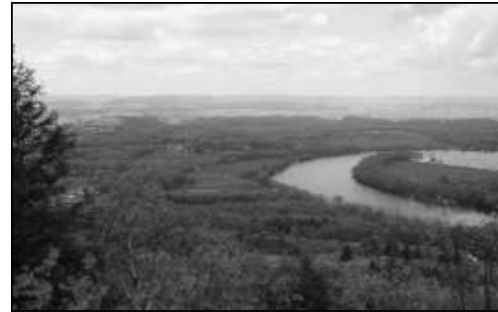
The Oxbow, from Mount Tom.

Massachusetts Electric Customers wishing to obtain an enrollment form for GreenerWatts New England may send an email request to energyhome@yahoo.com or call CET at 800-238-1221. Or learn more and enroll online at www.GreenerWattsNewEngland.com . Remember, to support the Berkshire Chapter, mention the AMC when you enroll!