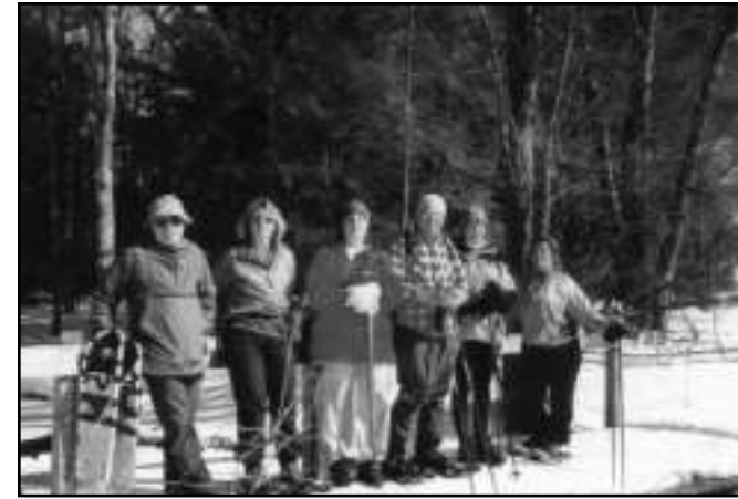
Long Pond, Royalston.

Overall, this hike turned out great. I look forward to leading more!