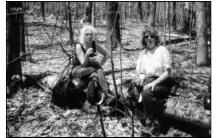
A pleasant summer day on Mount Greylock.