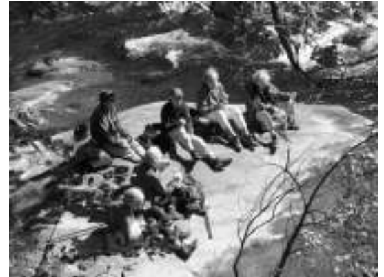
TUESDAY HIKERS take a lunch break on the Westfield River.