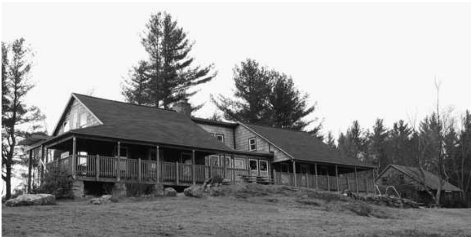
Noble View Camp's Double Cottage and North Cottage.