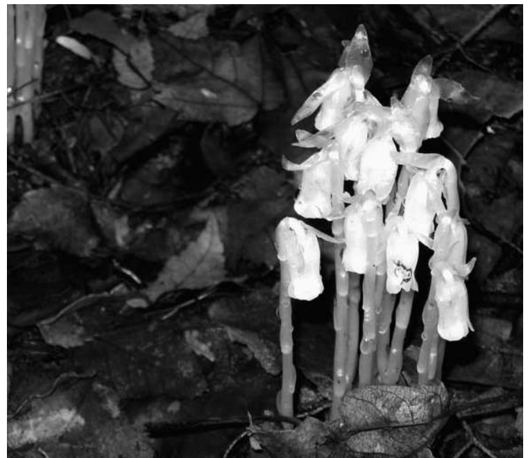
Indian pipe along Laurel Lane.