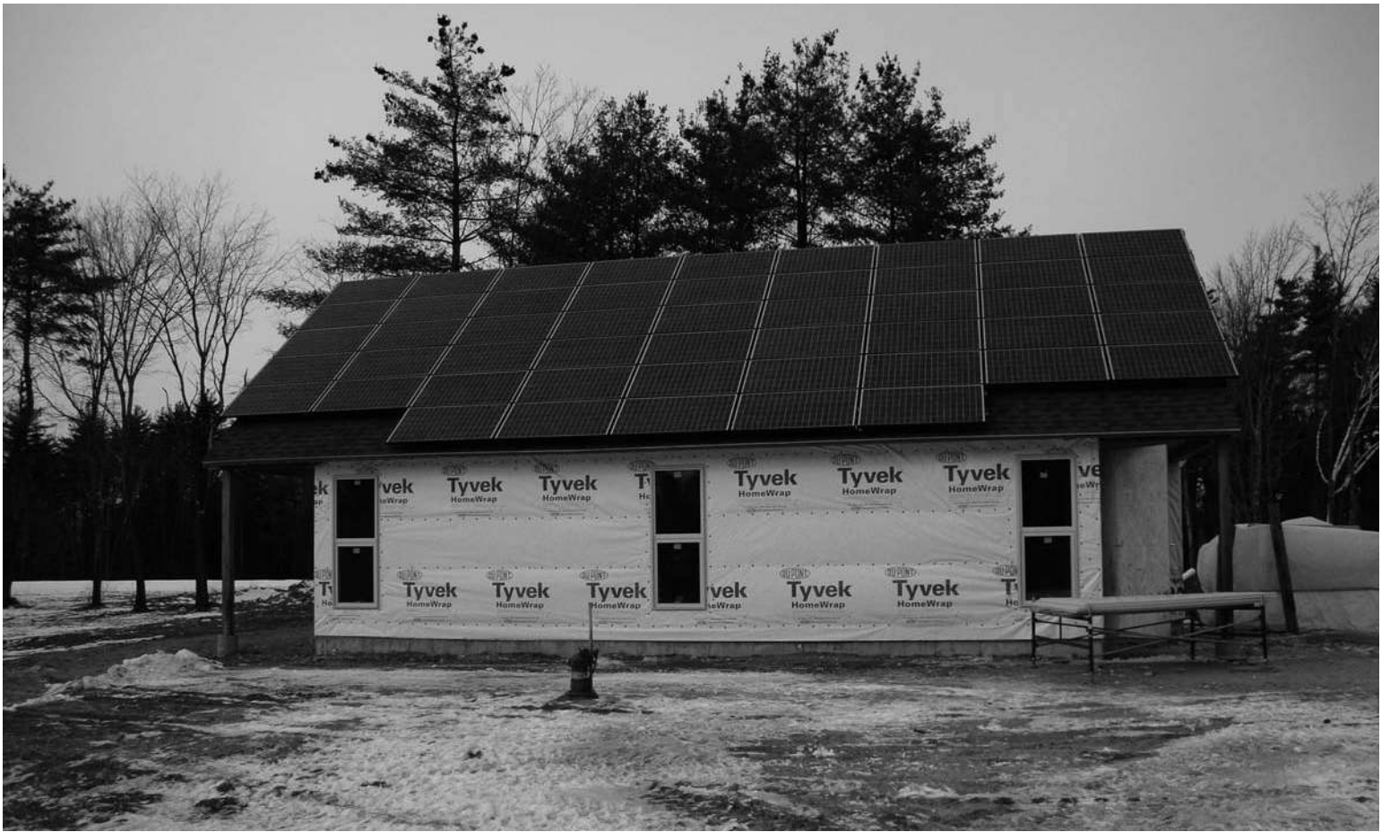
At Noble View Outdoor Center, the bathhouse's solar panels are already producing electricity.