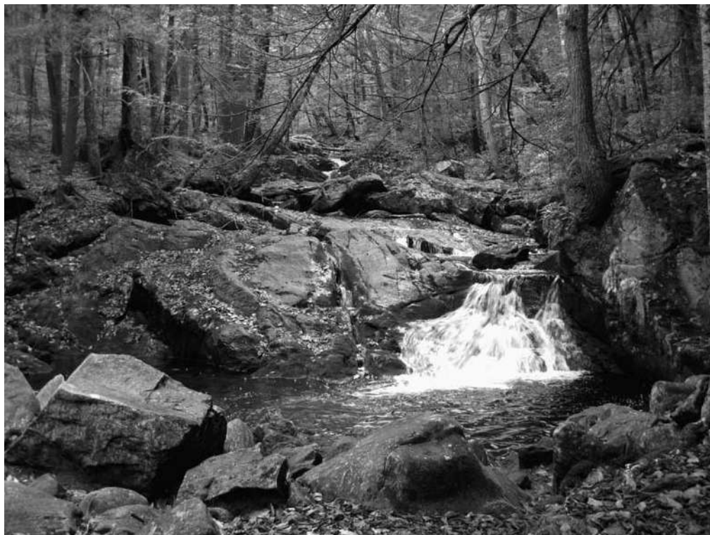
Waterfall in Granville State Forest.

To get there from Rte. 57 in Granville, take West Hartland Road heading south. Immediately after crossing the bridge, turn left into the parking lot. Note that the Mass. Department of Conservation and Recreation operates a campground further south on West Hartland Road.