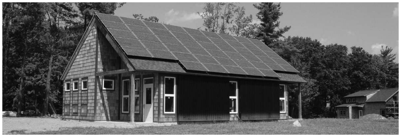
At Noble View Outdoor Center, the bathhouse's exterior is completed. It's expected to be open this November.

The AMC 2010 Fall Gathering, hosted by the Worcester Chapter, will be held October 15–17 at the Prindle Pond Conference Center Hilltop, Charlton, MA. Whether you enjoy hiking, biking, paddling, rock climbing, or just like to socialize with other AMC members (or non-members), October is a great time to explore central Massachusetts. Also, family-oriented activities will be offered, so bring your children and grandchildren. Top it all off with lively Saturday evening entertainment and a bonfire. This will be an event you won't want to miss! For more information, check out our website at: http://www.amcworcester.org/FallGathering2010.htm.