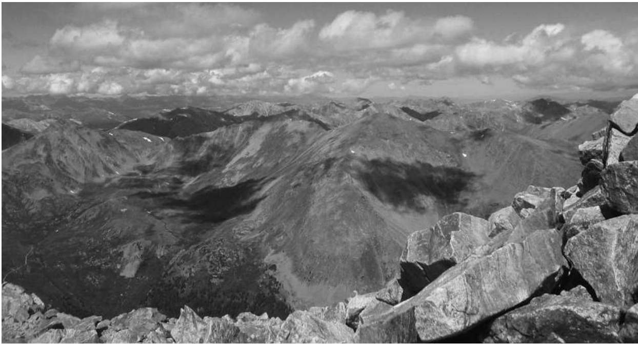
On Mount Elbert, Colorado.