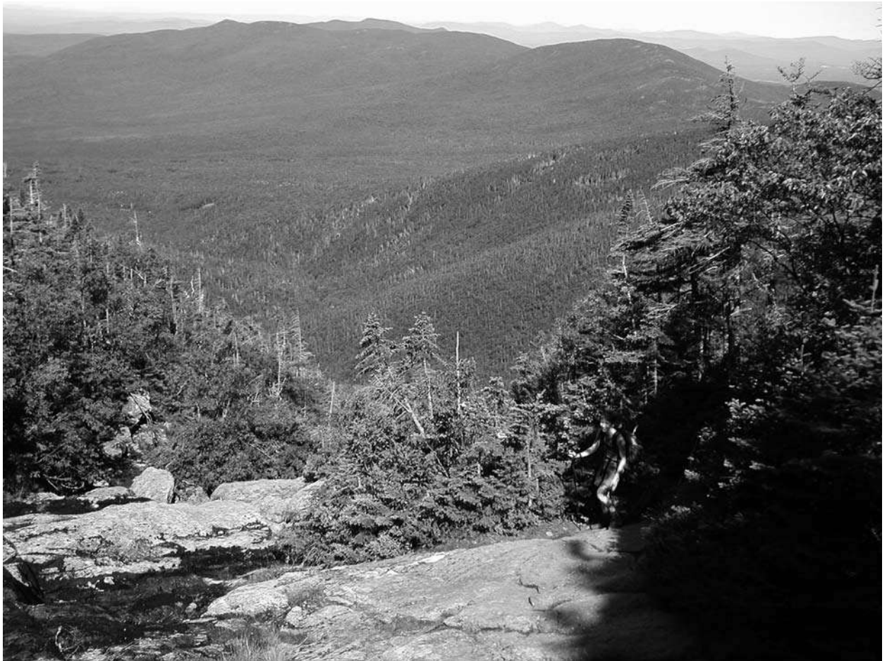
Climbing up the Ammonoosuc Ravine Trail on Mount Washington, New Hampshire