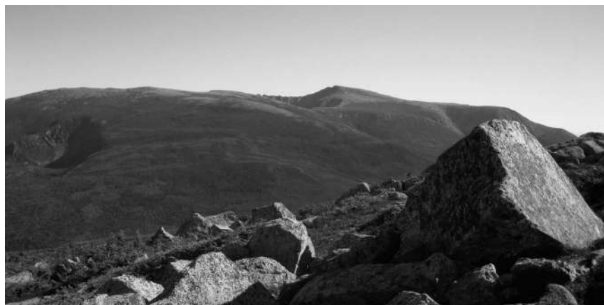
View of Katahdin from North Brother.

The weather again was questionable as I jumped in the car and headed west towards the ME/NH border and my last Maine peak, Old Speck. The drive was slow and snowy and an 8-foot moose walked in front of my car at one point. I got a nice picture of his backside as he sauntered off into the woods. After about three hours I made it to Grafton Notch where the snow was blowing hard and I decided to sleep on my hike-or-no-hike