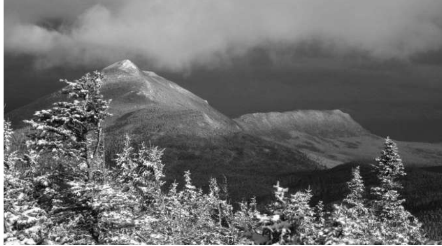
Bigelow Range.

been inspired by our new experience at the Saddleback resort, we decided to approach Sugarloaf via the ski area. After asking the Sugarloaf Hotel receptionist what the best trail to the summit was, and getting an answer that clearly showed she had no idea, we looked at the big ski trail map billboard out front and headed up the most direct slope. WARNING: DO NOT HIKE TO SUMMITS UP SKI SLOPES. These are apparently meant only for going down. OK, so I'm not a marathoner like my cousin Denise, but I'm in pretty decent shape and can average about a 2 MPH pace up and down the slopes of the Whites. Hiking the 1.5-2 miles