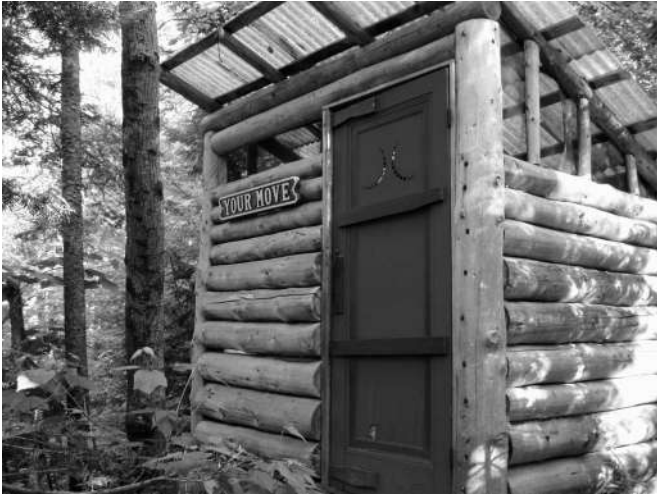
Outhouse near Piazza Rock.

The four weekends I spent exploring the Maine peaks will be with me for a long time. I'm already planning a family vacation up around Rangeley Lake for next summer. What a great spot to walk and boat and relax in Mother Nature's backyard. And of course, while the peaks are down, there's still a lot of AT sections to redline, especially the 100-Mile Wilderness. I'd like to send a special thanks to all those many AMC volunteers who have made the trail system the gem that it is. You have done an outstanding job not only maintaining trails, but crafting unique camps and outhouses, and creating one-of-a-kind outdoor experiences. Well, I think after writing this I have to hit the slopes again. Perhaps a Vermont 5 peak blitz this weekend and on to the Adirondacks next. Who knows? Now stop reading this and GET OUTDOORS!