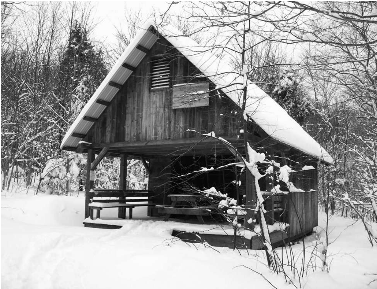
Stratton Pond Shelter, Long Trail, Vermont.