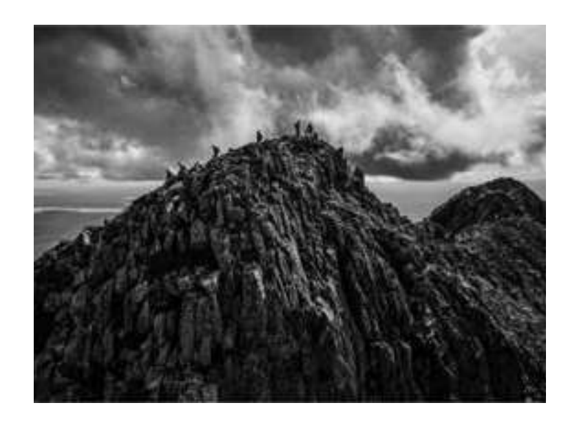
Knifes Edge – 2015 Landscape and Nature Winner

Enter your photographs and to be eligible to win great prizes, including a spot in a photography workshop with an accompanying stay at an AMC lodge and outdoor gear from Deuter, Forty Below, LEKI, LifeStraw, and other manufacturers. Plus, score serious bragging rights! Visit <a href="https://www.outdoors.org/photocontest">www.outdoors.org/photocontest</a> for complete rules and more information.