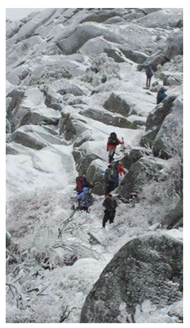
A mix of AMC members from both the Worcester and Berkshire Chapters snowshoe up Mt. Monadnock.

Our second goal is to fill open positions and to plan for succession of current members on our Executive Leadership team, including finding our next Co-Chair. We have a great group of people keeping the Berkshire Chapter organized and fulfilling our mission to promote the protection, enjoyment, and understanding of the mountains, forest, waters, and trails of the Appalachian region.