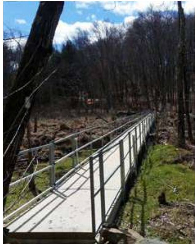
A northern view of the NET section 1 bridge.